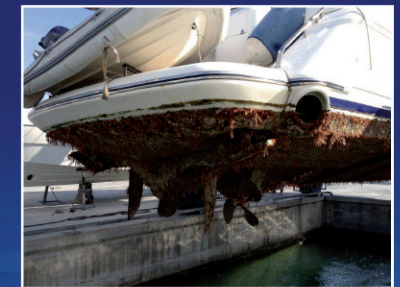
Boat without Harsonic® for boats

We'd like to contribute to a clean and healthy world. Current products to combat fouling have been proven to be of very bad influence on health and environment. The ultrasound waves are totally harmless.